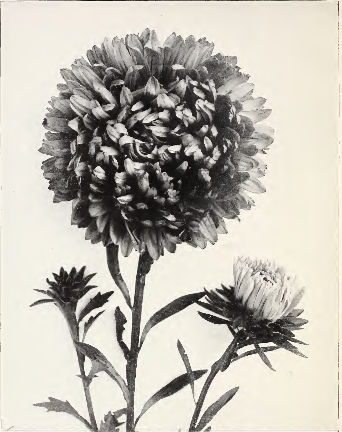
ASTERS—LATE BEAUTY PURPLE